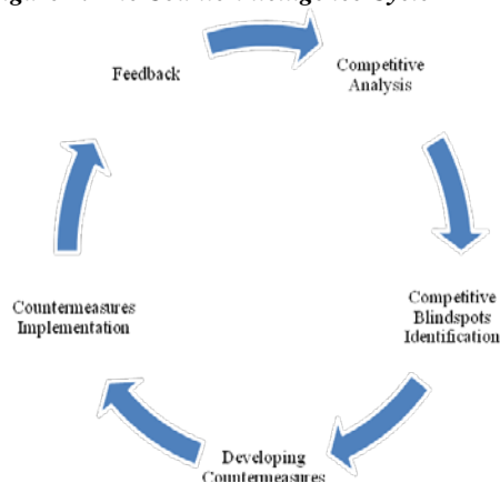
Figure 4: The Counterintelligence Cycle

To sum up, the most fundamental goal of the counterintelligence unit is to ensure proactive countering of threats and to enhance corporate security in general by protecting the assets not only against criminal theft but also against entirely legal competitive intelligence efforts by business rivals.