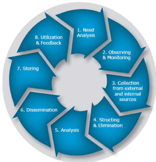
Figure 3: The Competitive Intelligence Cycle

(The figure is excerpted from Global Intelligence Alliance (2004) Introduction to Competitive Intelligence. GIA White Paper 1, p. 11)