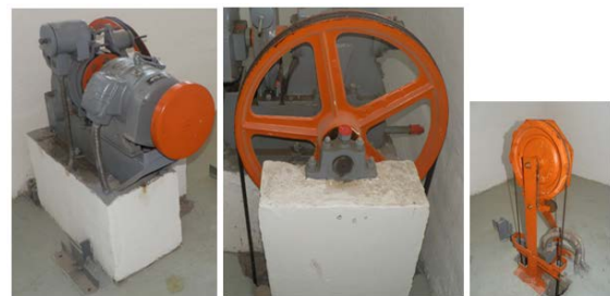
Fig. 3 Elevator machinery, traction wheel and speed-limiter