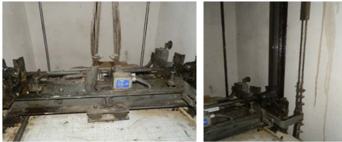
Fig. 6 Suspension carrier-beam

Fig. 5 shows a view of the upper part of the car construction.