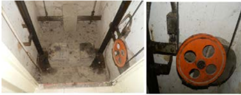
Fig. 5 View to the shaft [1]

Fig. no. 4 shows a view into the lift shaft – the suspension devices, the speed-limiter, the counterweights and the terminal switch are depicted.