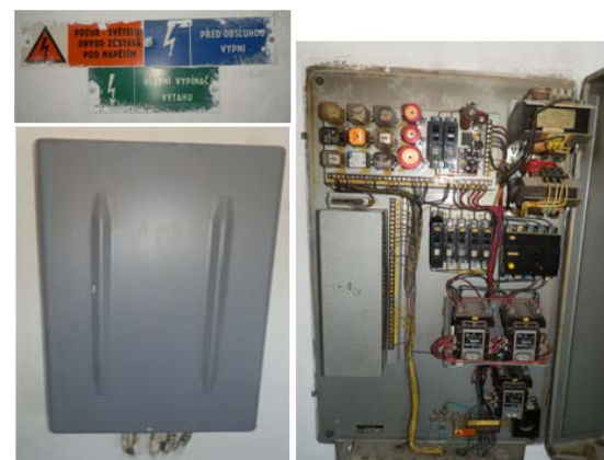
Fig. 4 Electric installation of the lift