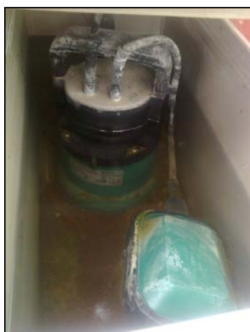
Fig. 3: The submersible pump.

The nutrient solution was pumped into the gravity cup (Fig. 4), then with the help of gravity it got into the channel through the pipe network.