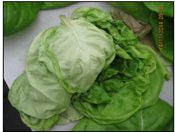
Fig. 6: The leaves turned yellow and brown after high Mg-treatments.

We took samples from the hydroponic tanks to test their EC. Changes in the electrical conductivity are shown in Fig. 7. The control had the lowest EC values (1.95 and 2.05 mS/cm) and the 250 mg/l the highest (3.68 and 4.00 mS/cm). The EC values increased along with the magnesium concentration.