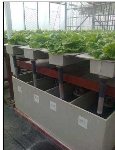
Fig. 1: The 28 l tanks.

We filled the hydroponic tanks of 28 liters (Fig. 1) with a new nutrient solution every week. Only highly soluble fertilizers were used. In the hydroponic production watering with the nutrient solution was done using an automated pump system, two times a day for 15 minutes. On the main switch (Fig. 2) we configured when the submersible pump (Fig. 3) should be active. The circulation of the nutrient solution started at 10 and 14 o'clock.