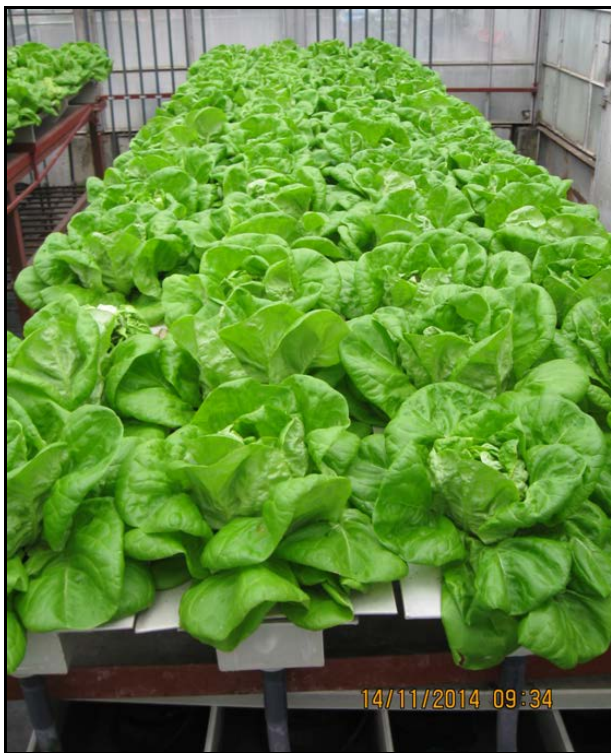
Fig. 5: Hydroponic lettuce in stone wool.

We took samples from the hydroponic tanks to test their EC. Changes in the electrical conductivity are shown in Fig. 7. The control had the lowest EC values (1.95 and 2.05 mS/cm) and the 250 mg/l the highest (3.68 and 4.00 mS/cm). The EC values increased along with the magnesium concentration.