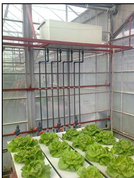
Fig. 4: The gravity cup.

The nutrient solution was pumped into the gravity cup (Fig. 4), then with the help of gravity it got into the channel through the pipe network.