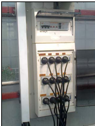
Fig. 2: The main switch of the automated system.