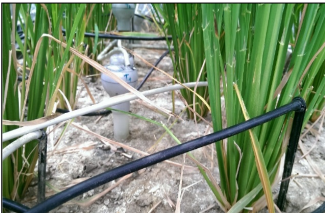
Figure 2: dripper installed next to a planting hill

Each drip emits 1.2 l/hr of water to plants. Single irrigation event was set to 5 minutes and allowed to distribute water for 2 hours. After 2 hours, if required threshold level is not achieved then it re-irrigates to bring down the soil tensions.