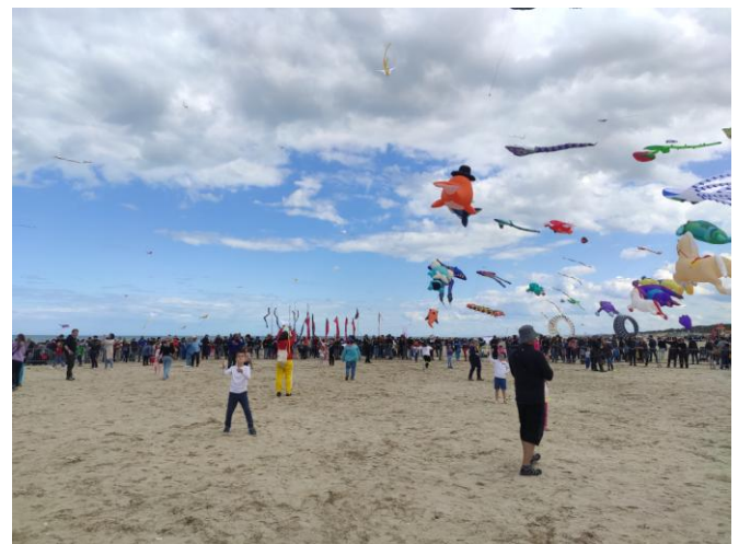
Fig. 1 Artevento International Kite Festival 2022, Cervia, Italy

Thus, one of the forms of regional tourist activity, in particular, in territorial communities is the organization of the festival. Our categorization of festivals allows us to state that for the majority of territorial communities of Ukraine the most promising and generally possible is the organization of tourist festivals of the second type. For the development of not only domestic but also inbound tourism, the festival should be given international status, ie the participation of foreigners. A special thematic type of international festivals are kite festivals (Fig. 1).