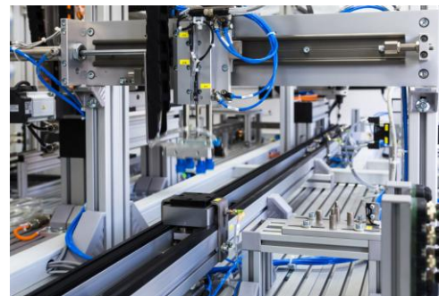
Fig. 2 Third station. Bearing cap is positioned on housing.

Station Three: Another Cartesian manipulator (Fig. 1) takes charge in this station, positioning the bearing cap onto the housing. The manipulator's precise movements guarantee a secure and accurate placement of the bearing cap.