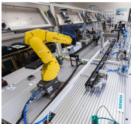
Fig. 1 Assembly line.

Station One: In this station, an operator places the housing of the bearing onto the conveyor. To identify the specific product for the assembly line, an RFID system is employed, allowing for accurate tracking and traceability.