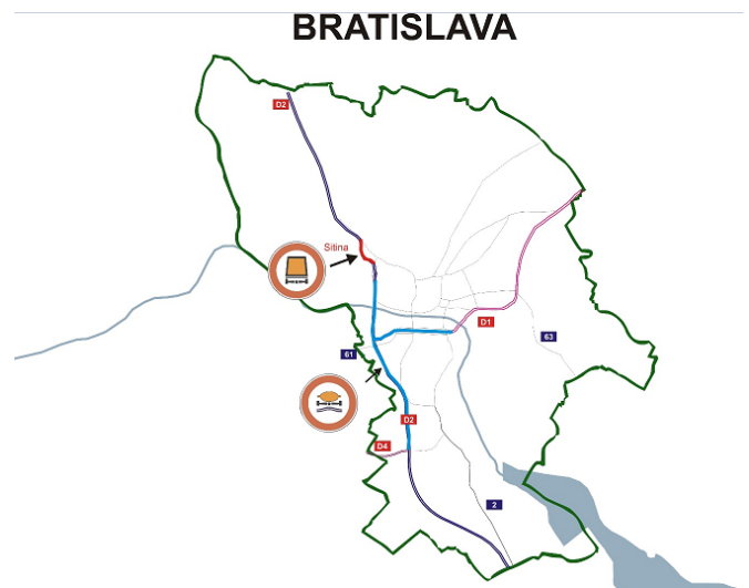
Fig. 1 Red zone, where it is not possible to transport dangerous cargo, and blue zone, where it is not possible to transport substances that may pollute water sources.

crude oil, petroleum materials or other pollutants. The quantity as well as type of cargo can be marked on supplementary tables.