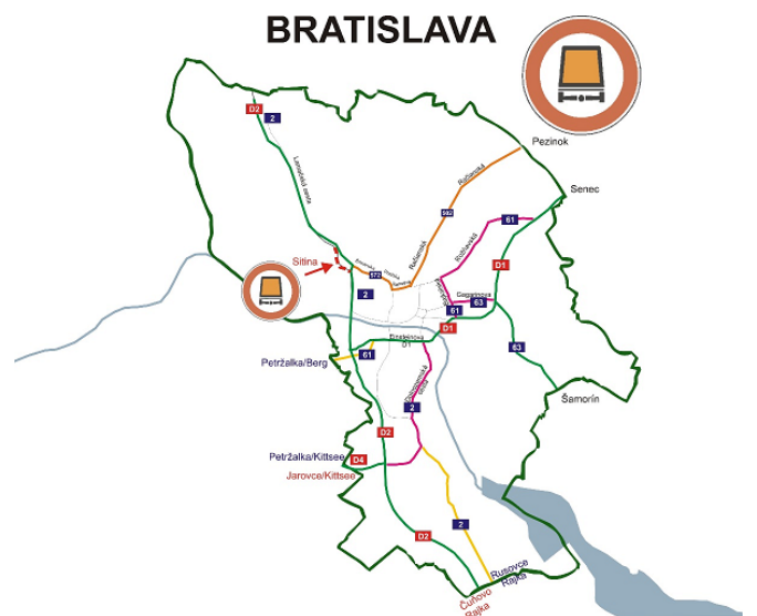
Fig. 3 Routes for transportation of dangerous goods

After reflecting this situation alternate routes for vehicles transporting were incorporated into the map. In Figure 3 recommended routes for dangerous goods are marked green. Orange is the alternate route when driving from the direction of Pezinok towards Račianska, Pražská and Lamačská cesta (II/502, II/572, I/2). Yellow is for alternate routes for vehicles with maximum weight of 3.5 tonnes towards the border crossing points Petržalka-Berg (I/61), Petržalka-Kitsee (local road) and Rusovce-Rajka (I/2). Pink is for alternate routes Rožňavská, Dolnozemska cesta in the direction to Austria/Hungary (I/61, I/2). More detailed information are provided in the table N.2