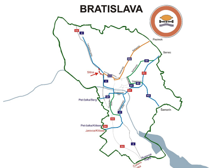
Fig. 4 Routes for the vehicles, which may cause water pollution. Source: Authors

Transportation of dangerous cargo that may pollute the environment, especially water, is more complicated than transportation of other dangerous goods, as it should be to diverted from highways D1 and D2 because of entry bans into the areas with location of water resources for the city Bratislava (Pečniansky les). In Figure N.4 there are blue marked recommended routes for transportation of cargo that may cause water pollution, green and orange are alternative routes for these cases. When driving to the Czech republic from the direction of Senec, it is recommended to use the highway D1, along Einsteinova and “Most SNP”, then by the local road along the Danube embankment, across Mlynská dolina to Lamačská and finally connecting to the highway D2 (D1, I/61, I/2, D2). Suggested route for the direction to Austria or Hungary coming from Senec shall be Prístavný most, Dolnozemska cesta, III.class road with connection to the highway D2 to Hungary or D4 to Austria ((D1, I/2, III/00246, D4 or D2). When coming from the Czech republic we suggest the route D2, Lamačská cesta, Mlynská dolina, local road along the Danube embankment, “Most SNP”, Panónska, Dolnozemska, the road III/00246 connecting to the highway D2 to Hungary or D4 to Austria ((D2, I/2, MK, I/2, III/00246, D2 or D4). Alternate routes for these routes are given in the Table N.3.