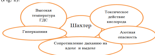
Fig.2. The main factors of adverse effects on a human induced by the mine self-rescuer.

In addition, when the miner is connected to RPE, he is affected by negative factors related to the design features and operational characteristics of the mine self-rescuer, the combined and associated effects of which can initiate life-threatening conditions for miners emerging in conditions of gas contamination, smoke, increased temperature. These pathogenic factors include the high temperature of inhaled GRM, which can cause burns of the upper respiratory tract, lungs; increasing resistance during the inhalation and the exhalation in hyperventilation conditions under the physical exertion; normobaric hyperoxia; toxic effects of normobaric hyperoxic GRM (gas-respiratory mixture); hyperoxic hypoxia; the phenomenon of nitrogen washing-out from the human body, which represents "nitrogen hazard"; the dryness of GRM; increasing uncompensated hypercapnia. Psychological and physical exertion in conditions of emergencies in a coal mine are able to potentiate the negative effects caused by connection to the mine self-rescuer. Therefore, it is reasonable to consider in detail the factors caused by the chemical reaction when connected to the mine self-rescuer, negatively affecting the respiratory system and respiratory comfort (Fig. 2).