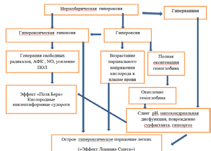
Fig. 3. General scheme of pathogenesis of normobaric hyperoxia during breathing when one use a mine self-rescuer with chemically bound oxygen.

protective reactions is of dual character. The spasm of capillaries, slowing of blood flow induce the development of hypercapnia and pH shift to the acid side (metabolic acidosis), which triggers the mechanisms of mitochondrial dysfunction. It completely levels out the defensive reaction of organism. And the physiological adaptive reactions of organism develop into a pathological reaction of toxic effect of oxygen (Fig. 2). Traditionally it is considered that the safe exposure to normobaric hyperoxia for a healthy person does not exceed 2-3 hours. In addition, several researchers note the pronounced variability of individual sensitivity to the oxygen intoxication. The psychoemotional stress, intense physical exertion, hypercapnia can change the sensitivity to the toxic effect of hyperoxia. The pathogenesis of normobaric hyperoxia is due to the toxic effect of oxygen and is associated with the generation of active species of oxygen and nitrogen monoxide (NO). But the imbalance between the antioxidant defense of organism and oxidative stress is in the base of many pathological processes.